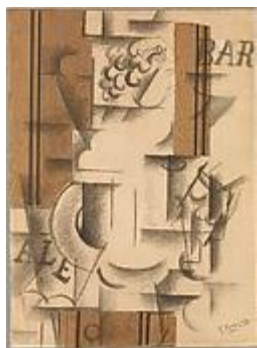
Georges Braque Fruit Dish and Glass Sorgues, autumn 1912 Charcoal and cut-and-pasted printed wallpaper with gouache on white laid paper; subsequently mounted on paperboard 24 3/4 × 18 in. / 62.9 × 45.7 cm Promised Gift from the Leonard A. Lauder Cubist Collection © 2014 Artists Rights Society (ARS), New York / ADAGP, Paris