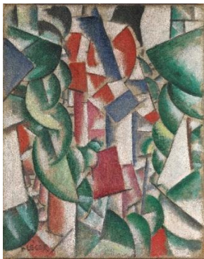
Recto Fernand Léger Houses under the Trees 1913