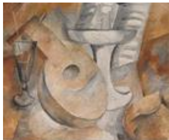
Georges Braque Mandolin and Fruit Dish Paris, early 1909 Oil on canvas 15 1/8 × 18 1/8 in. / 38.4 × 46 cm Promised Gift from the Leonard A. Lauder Cubist Collection © 2014 Artists Rights Society (ARS), New York / ADAGP, Paris