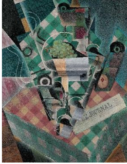
Juan Gris Still Life with Checked Tablecloth Paris, spring 1915 Oil on canvas 45 7/8 x 35 1/8 inches (116.5 x 89.2 cm) The Metropolitan Museum of Art, Leonard A. Lauder Cubist Collection, Purchase, Leonard A. Lauder Gift, 2014 (2014.463)