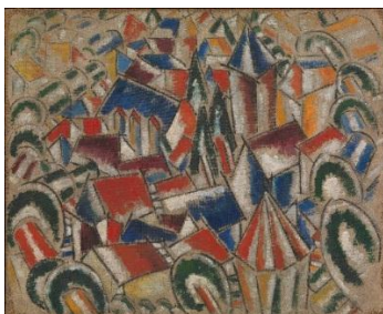
Fernand Léger The Village 1914 Oil on canvas