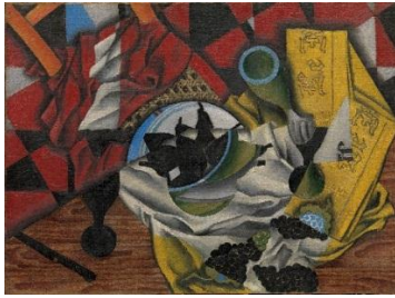
Juan Gris Pears and Grapes on a Table Céret, autumn 1913 Oil on canvas 21 1/2 x 28 3/4 in. / 54.6 x 73 cm Promised Gift from the Leonard A. Lauder Cubist Collection