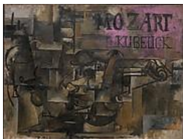
Georges Braque Violin: "Mozart Kubelick" Paris, spring 1912 Oil on canvas 18 x 24 in. / 45.7 x 61 cm Promised Gift from the Leonard A. Lauder Cubist Collection © 2014 Artists Rights Society (ARS), New York / ADAGP, Paris