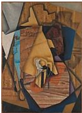
Juan Gris The Man at the Café Paris, 1914 Oil and newsprint collage on canvas 39 x 28 1/4 in. / 99.1 x 71.8 cm Promised Gift from the Leonard A. Lauder Cubist Collection