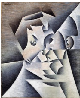
Juan Gris Head of a Woman (Portrait of the Artist's Mother) Paris, 1912 Oil on canvas 21 3/16 x 18 1/4 in. / 53.8 x 46.4 cm Promised Gift from the Leonard A. Lauder Cubist Collection